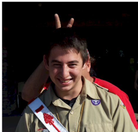
Our New Section Chief