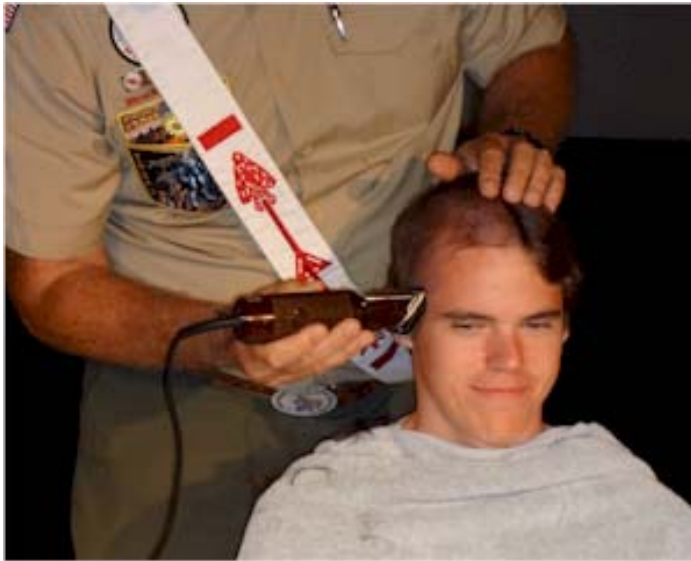
Section Chief honors his challenge