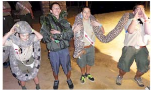
Getting the crowd cheering