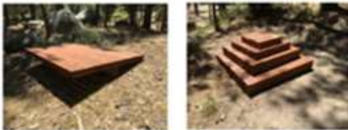
Examples of the Low COPE Elements built from camp trees.